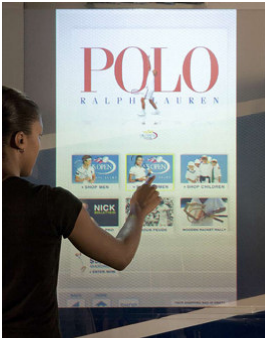
Polo Ralph Lauren’s Interactive Store Window reinvents the Retail Store Window with a Credit Card Reader mounted on the exterior store window—allows 24/7 Window Shopping