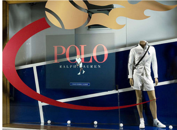
Polo Ralph Lauren's Interactive Store Window Madison Avenue, New York City, USA